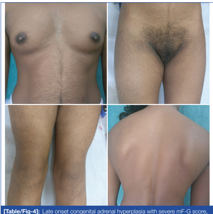
[Table/Fig-4]: Late onset congenital adrenal hyperplasia with severe mF-G score, hypoplastic breasts and muscular habitus.

(free testosterone) were raised in PCOS and IH women, while serum DHEAS were raised in HAIR-AN, CAH and PCOS, but there was no statistically significant difference between the groups. WC and serum fasting insulin were statistically significant in HAIR-AN group as compared to other groups. HOMA-IR was significantly raised in HAIR-AN group as compared to CAH but there was no statistically significant difference between other groups (PCOS, IH and hypothyroidism). [Table/Fig-7] showing clinical photograph of HAIR-AN patients. [Table/Fig-5] depicts mean values of WC, BMI, mF-G score and hormone profile in different aetiologies of hirsutism. Hypothyroidism was seen only in four patients (8%) in whom other hormonal profile was within normal limit. Serum prolactin level was raised only in one patient (2%) who had PCOS. Serum lipid profile was deranged in three patients (6%), one each of IH, PCOS and HAIR-AN syndrome. In all of these three patients, only hypertriglyceridemia was noted [Table/Fig-8].